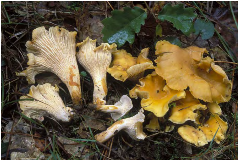
Cantharellus ilicis . BIO-Fungi 9983. Fresh basidiomata from the same patch as the holotype.