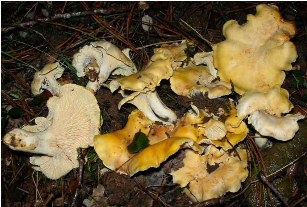
Cantharellus ilicis . Hholotype, BIO-Fungi 11689. Fresh basidiomata.